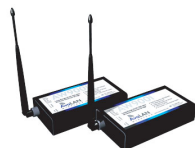
AW900i Kit - $699

Long-range 900MHz wireless outdoor Ethernet bridge. [requires antennae - use with AW15, AW11, AW10, AW8 or AW6].