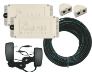
AW900x Kit - $999

Long-range 900MHz wireless outdoor Ethernet bridge. [requires antennae - use with AW15, AW11, AW10, AW8 or AW6].