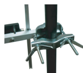
AW-APM - $19

AW900x pole mounting bracket. [Up to 2" pipe, AW-APM not required].