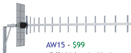
AW15 - $99