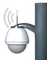
AW-H900 Kit - $1,399

Long-range 900MHz wireless dome for PTZ IP cameras.