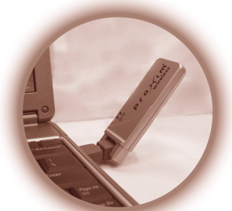
Wireless Access for Laptop Users