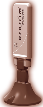
USB Client with Base Stand for PC Users