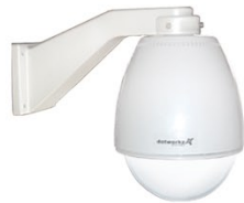
Dotworkz Marine Dome MDE Series