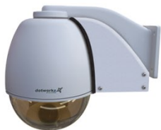
Dotworkz Cooldome™ XH Series