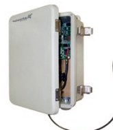
Dotworkz PF-128 Battery Backup System